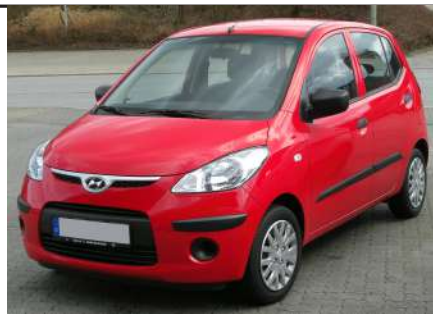
Hyundai i10 2013/14 From € 11,500.00 Call +590 690 22 96 66