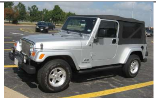
Jeep Wrangler Price on Request Call +590 690 22 96 66