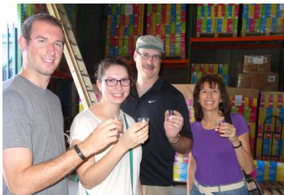
Enjoying the Rhum tasting experience!

Topper's Rhum committed to creating the world's best tasting rum and it is paying off: the deliciously flavored spirits are now available in six countries and 21 states in the USA, making it one of the very few items produced right here on St. Maarten and actually exported. Even the Dutch army made Topper's their choice of rum.