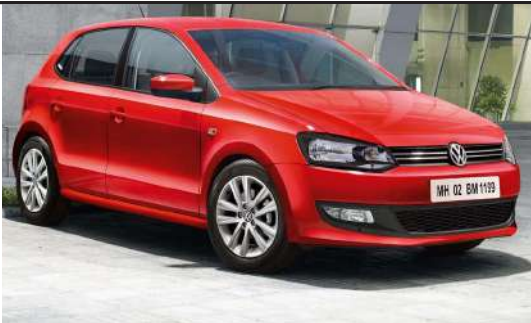
Volkswagen Polo 2016 European specs. Several from € 11,500.00 Call +590 690 22 96 66

Pictures below are model samples and do not show the actual cars offered.