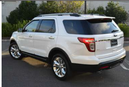
Ford Explorer 2013 € 11,000.00 Call +590 690 22 96 66