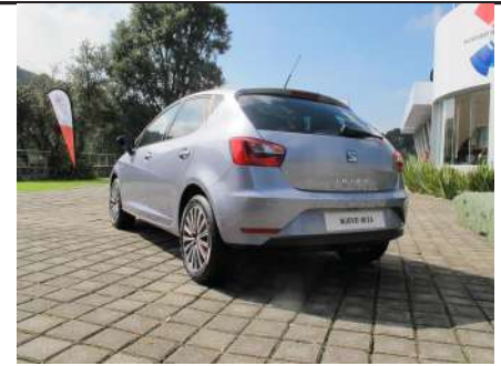
SEAT Ibiza 2017 European specs. Several from € 10,900.00 Call +590 690 22 96 66