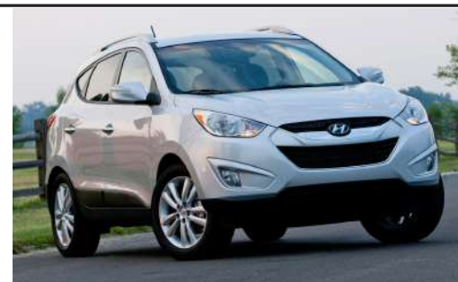
Hyundai Tuscon 2013 € 10,900.00 Call +590 690 22 96 66